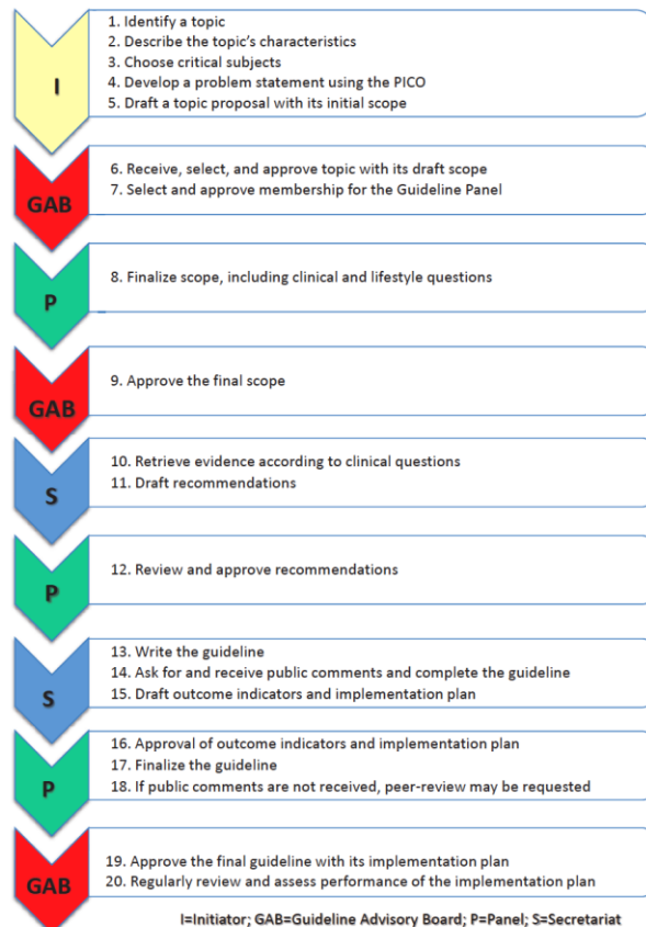
Figure 2: Estonian Guideline Development Process

The guideline development process involves a Guideline Advisory Board (GAB), which annually selects potential guidelines from proposed topics, defines the scope of the guidelines, selects a Guidelines Panel to oversee the guideline development process, approves all finalized guidelines and their respective implementation plans and assesses performance of guideline implementation. A Guidelines Secretariat, whose members are selected by Tartu University Medical Faculty and EHIF, provides technical support for the development of each guideline. Furthermore, the handbook stipulates that all guidelines prepared through this process should be updated every five years to reflect new evidence, granted that no important new evidence becomes available earlier.